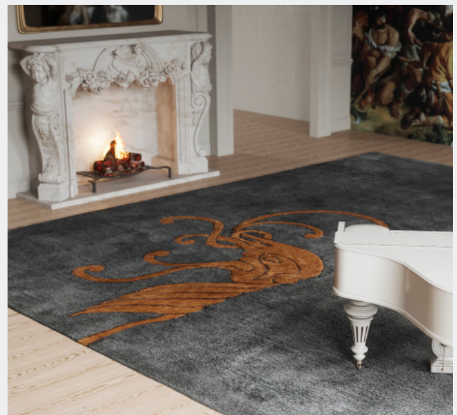
Detail of Grey Gold